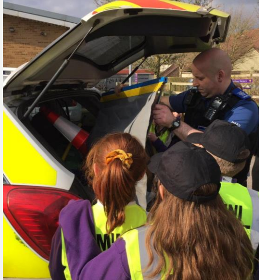
12 school drop in sessions