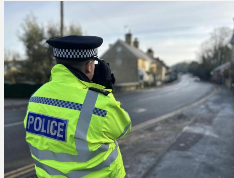
17 speed checks